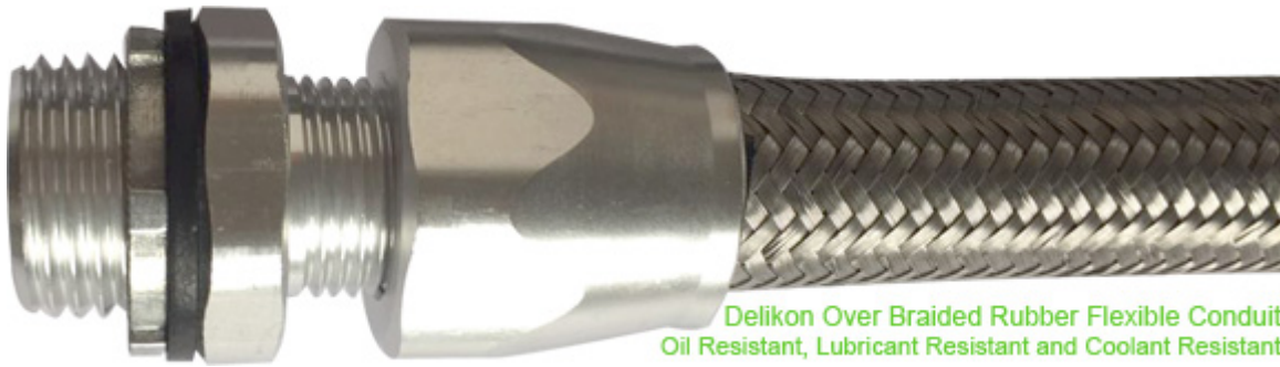
Delikon Over Braided Rubber Flexible Conduit Oil Resistant, Lubricant Resistant and Coolant Resistant

Delikon Oil Resistant Over Braided Flexible Conduit and Fittings system is ideally used in situations where a flexible conduit must withstand exposure to machine tool fluids, oils, dust, etc. The stainless steel over braiding provides abrasion resistance, and protection against Swarf or Chip. The conduit fittings clamp the inner conduit and the braiding tightly, and keep the conduit assembly liquid tight when subject to pressure or machine vibrations. Sizes of this over braided flexible rubber conduit are specially designed for machine tools power or data cables, motor cables and control cables. It could also be used for transferring machine fluids, such as oil, coolant.