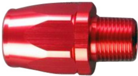
Straight Aluminum Connector for oil resistant over braided flexible rubber conduit. Oil resistant, liquid tight.

These conduit fittings clamp the inner conduit and the braiding tightly, and keep the conduit assembly liquid tight when subject to pressure or machine vibrations.